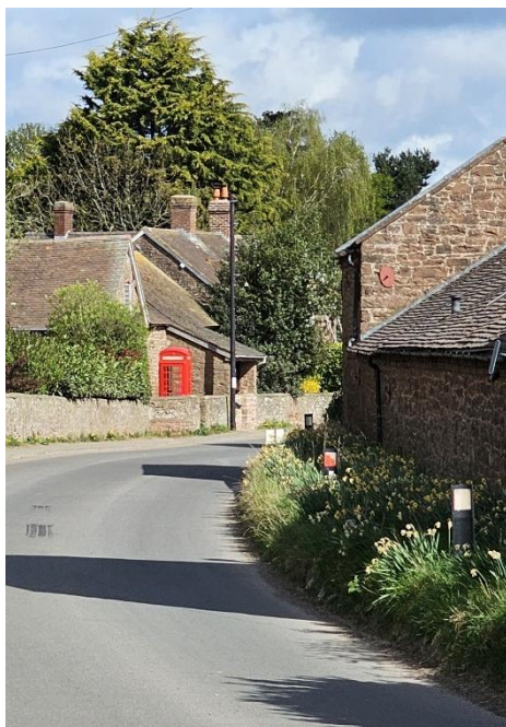
The Parish Council has recently arranged for the telephone boxes in Acton Burnell and Pitchford to be given a new coat of paint. Now looking very smart!